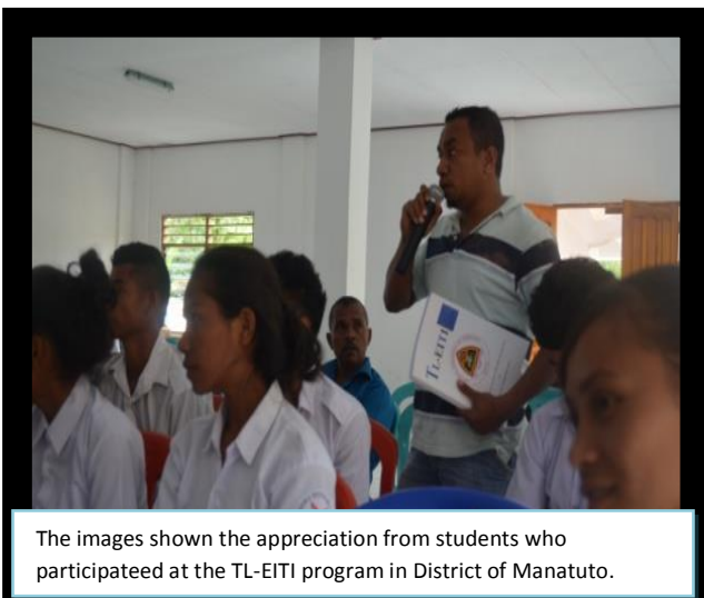
The images shown the appreciation from students who participated at the TL-EITI program in District of Manatuto.