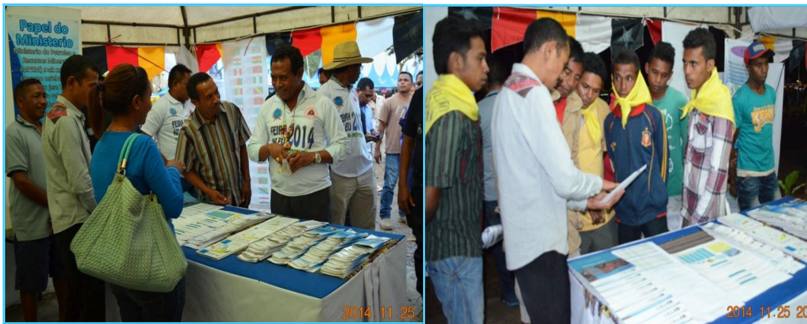
Vice Prime- Minister Fernando "Lasama" Araujo visited MPRM-TLEITI's stand

During the occasion of commemoration of the Popular Consultation Day on 30 August in the District of Suai and Proclamation of Independence Day on 28 November in the District of Aileu, TLEITI participated to share information through printed materials such as TLEITI reports and brochures, as well as actively responding to visitors' questions.